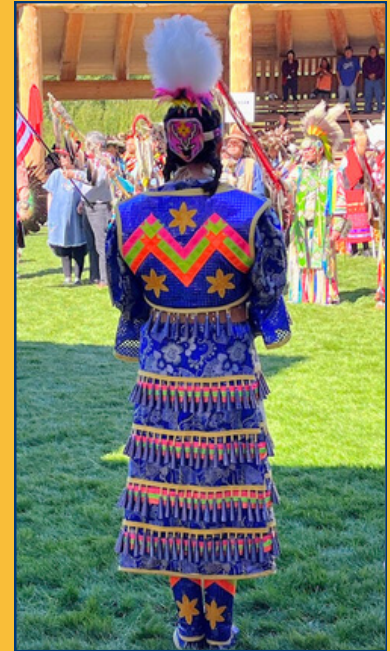
Williams Lake First Nation Powwow, September 2024

Operating on the traditional territory of the Secwépemc peoples, Mount Polley is committed to building meaningful partnerships with local First Nations. We recognize culturally significant days, such as National Day for Truth and Reconciliation and Orange Shirt Day, and we support events like the Williams Lake First Nation's Speaking our Truth competition powwow. This year we also hosted dedicated site tours for the Chief and Council members for our local First Nations partners, helping to strengthen these important relationships.