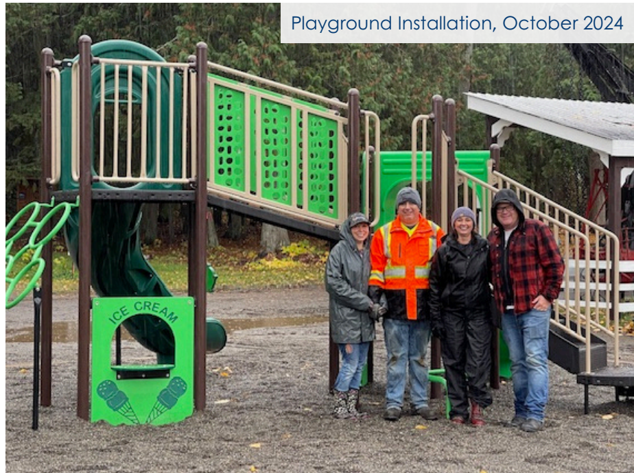
Playground Installation, October 2024

This fall, Mount Polley also welcomed public mine tours and school field trips, fostering community engagement and education. In November, a public meeting and tour were held, offering attendees the chance to ask questions and take a tour of the site. The small group size allowed for a more tailored experience, providing more time to address questions and areas of interest.