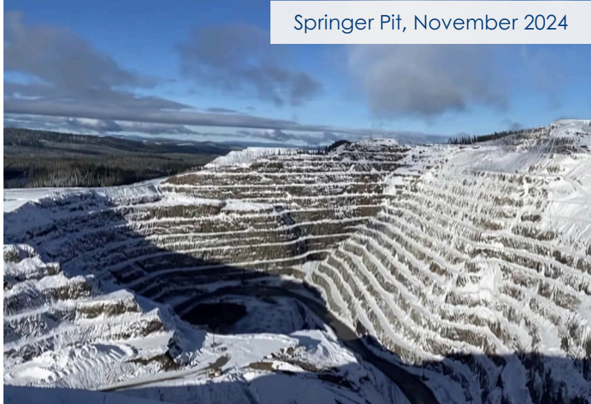
Springer Pit, November 2024

Mining operations remain focused on developing the Springer Pit, with excavation work planned on the north wall and pit base. As part of our ongoing pushback for Phase 5, we have mined approximately 3.97 million tonnes to the end of September 2024, and much of this material was hauled to the tailings storage facility (TSF) for buttress construction.