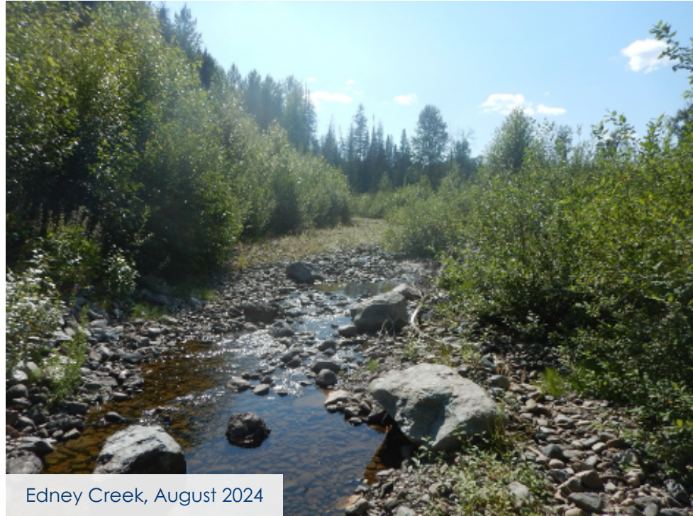
Edney Creek, August 2024

We also conduct ongoing surveys of spawning habitats, vegetation, and overall ecosystem health in and around Hazeltine and Edney creeks.