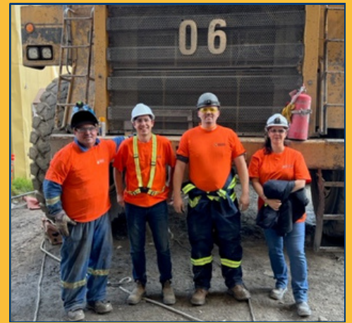
National Day for Truth and Reconciliation, September 2024