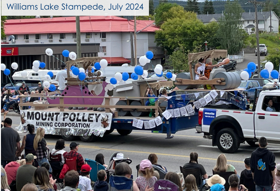
Williams Lake Stampede, July 2024