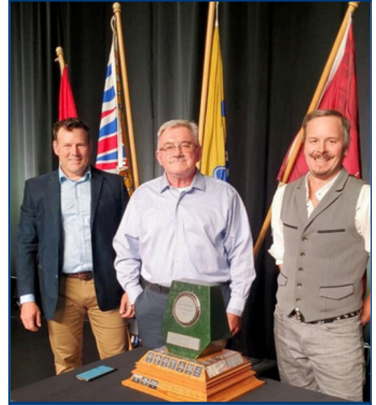
Award Ceremony, October 2023