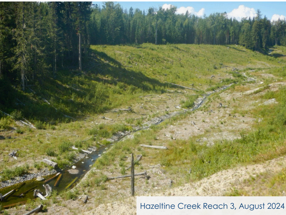
Hazeltine Creek Reach 3, August 2024