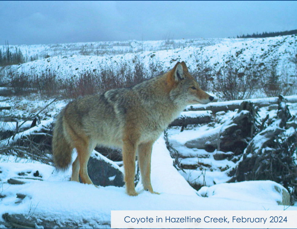
Coyote in Hazeltine Creek, February 2024